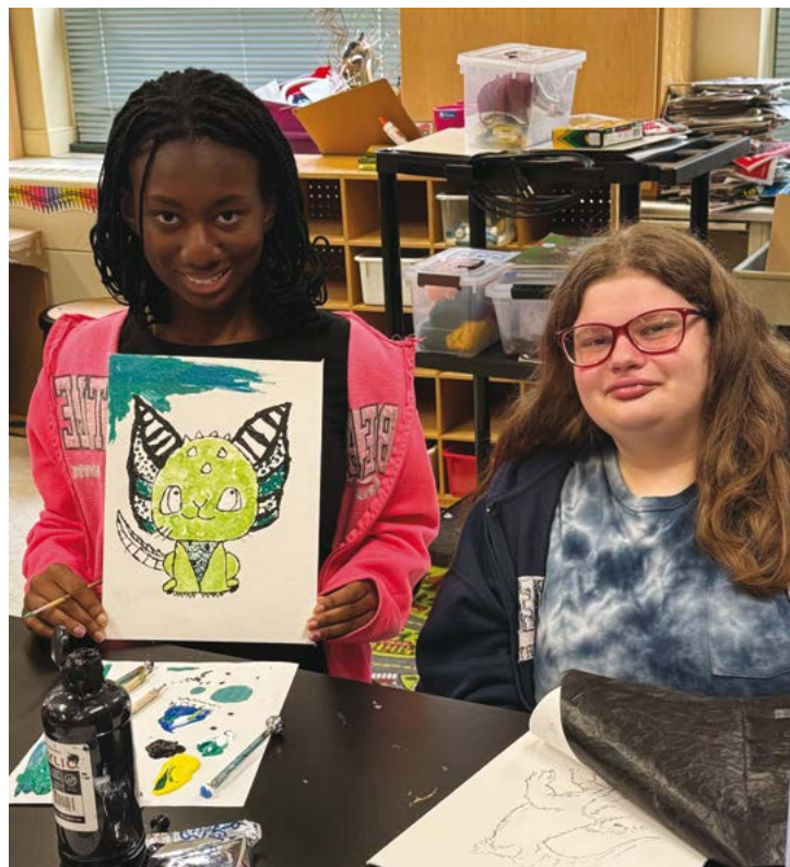
When families find the right fit, students thrive.