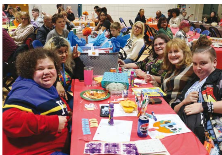
Families are an important component of student success. Events like Bingo allow families, students and staff to connect.