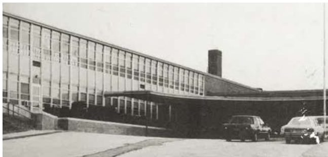
Changes and progress to Tillotson have occurred both inside and outside over the past 40 years.