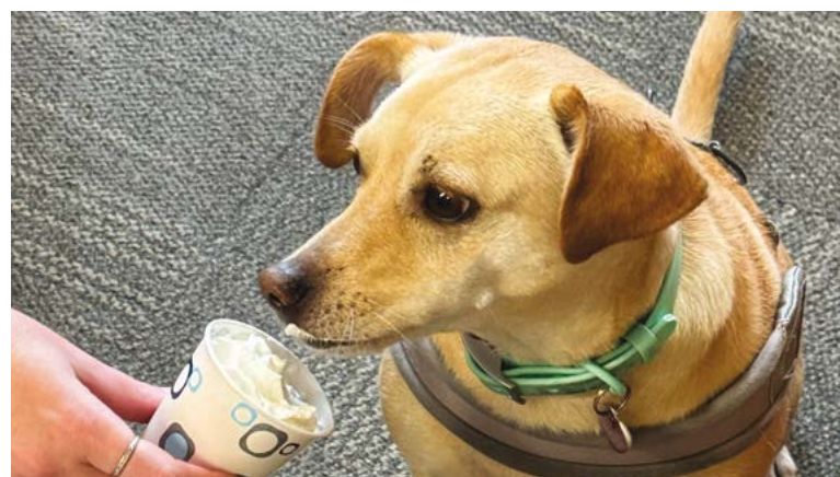
Poppy, Tillotson’s therapy dog, is good at sniffing out pup cups from the coffee shop. But she especially excels at helping students process through anxiety while at school.

Each new step of socializing and expressing himself is one more step to independence and a bright future for Christian.